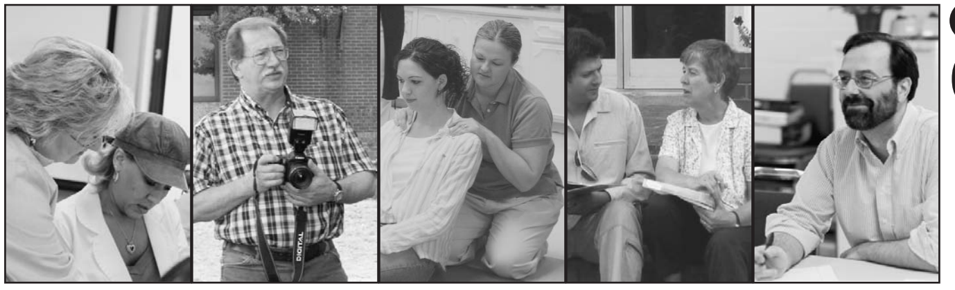
Administration, Faculty, and Staff